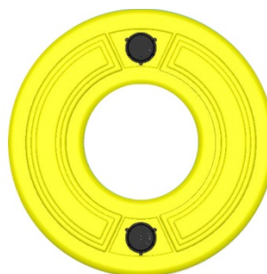
Annu-drum plan view