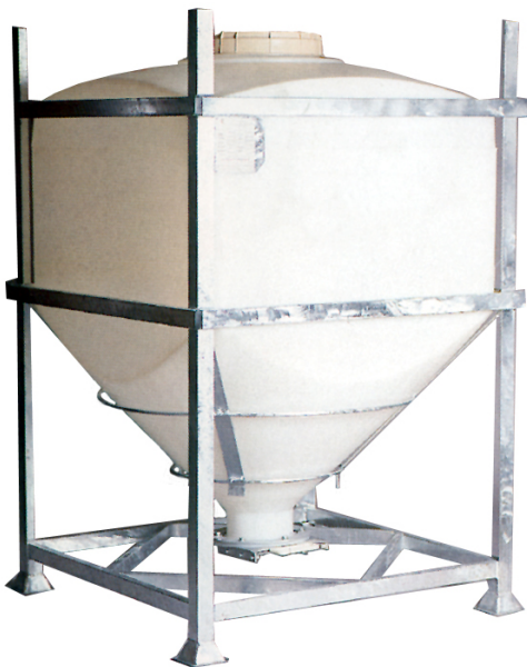
Container shown is a DGC 750-90° fitted with a 14" screw lid and an 8" slide valve