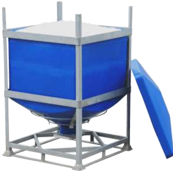
Container shown is a DGO 1000 - 120° fitted with a removable open top lid, galvanised frame and a 10° slide valve, without anti tilts.

The liner inlet which is 350mm in diameter has a HDPE 2 screw cap fitted with an SR 3 O-ring seal as standard. The vertical outlet at the base of the frame can be specified with a variety of valves to suit individual applications.