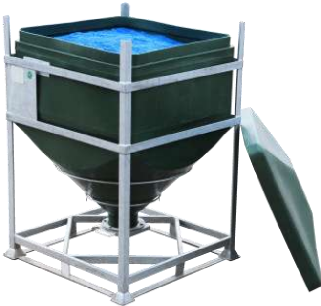
Container shown is a DGO 1000 - 90° fitted with a removable open top lid, galvanised frame and a 10° slide valve, without anti tilts.

The liner inlet which is 350mm in diameter has a HDPE 2 screw cap fitted with an SR 3 O-ring seal as standard. The vertical outlet at the base of the frame can be specified with a variety of valves to suit individual applications.