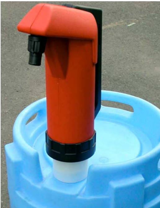
Type 2 Thread Adaptor connecting 45L Warboy and hand pump